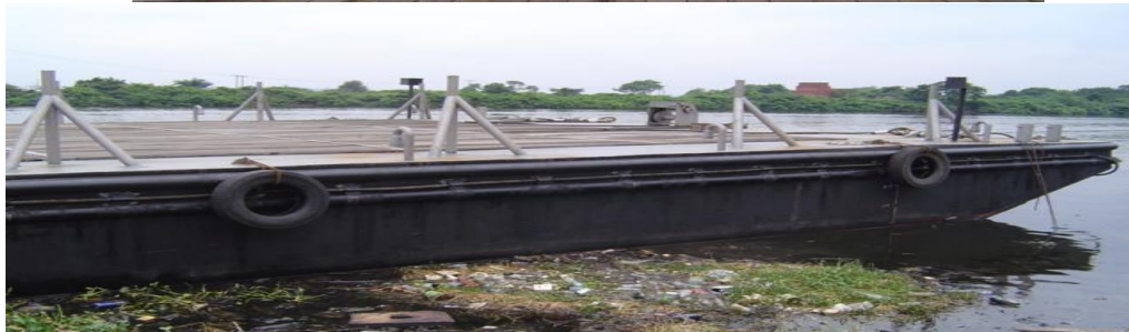
Starboard fwd showing deck, stanchions & lamp posts